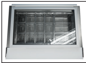
Glass Lid Top