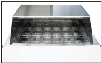
Removable cover with slide back lid

This product is equipped with a fine mesh filter to the front of the condenser to catch dust, and a rotating brush that moves up and down daily to remove excess buildup outward and away.