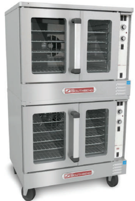
(BES/27SC shown with optional casters)

140°F to 500°F solid state thermostat and 60 minute mechanical cook timer.