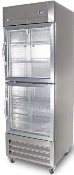
738317 (KCHRI27R2HGDR) 2-Half Glass Door Full Height Refrigerator 27" Long