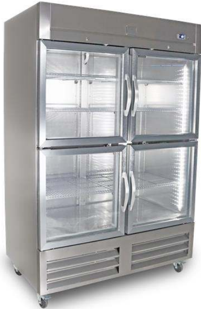
738316 (KCHRI54R4HGDR) 4-Half Glass Door Full Height Refrigerator 54" Long