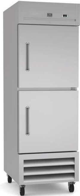
738280 (KCHRI27R2HDR) 2-Half Door Full Height Refrigerator 27" Long