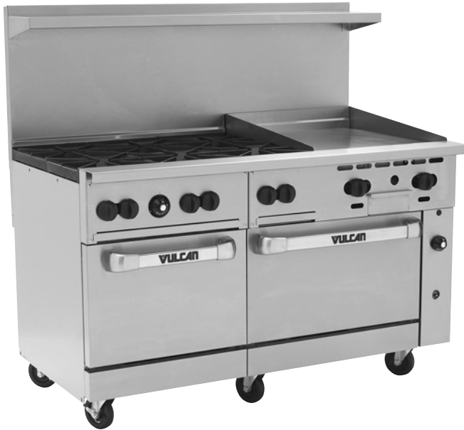
Model 60SS-6B24GN (shown with optional casters)