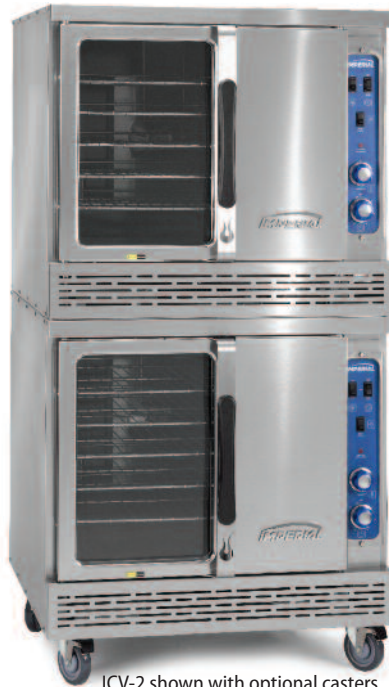
ICV-2 shown with optional casters

Four bearings per door extend the life of the door mechanism.