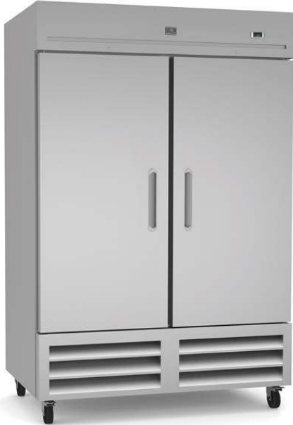
738242 (KCHRI54R2DRE) 2-door reach-in refrigerator, stainless steel, 49 cubic feet, R290 refrigerant gas, +33/+41°F - Energy Star