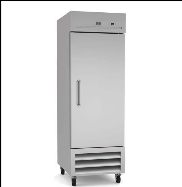
738241 (KCHRI27R1DRE) 1-door reach-in refrigerator, stainless steel, 23 cubic feet, R290 refrigerant gas, +33/+41 °F - Energy star