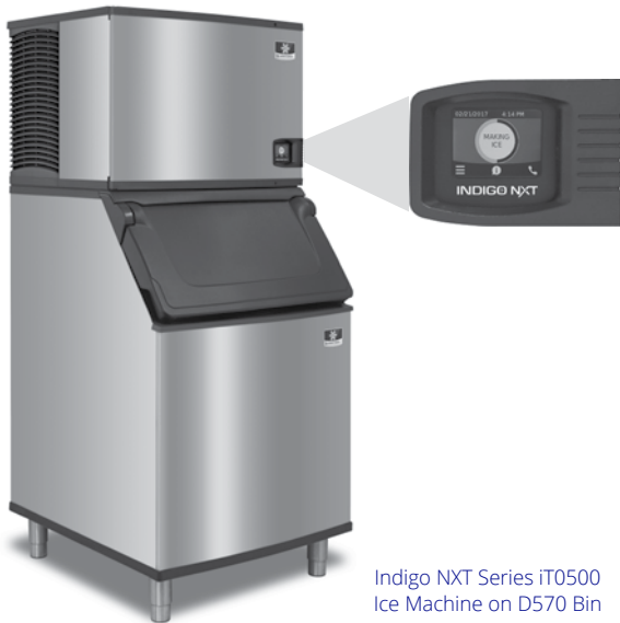
Indigo NXT Series iT0500 Ice Machine on D570 Bin

Designed for operators who know that ice is critical to their business, the Indigo NXT Series ice machine's preventative diagnostics continually monitor itself for reliable ice production. Improvements in cleanability and programmability make your ice machine easy to own and less expensive to operate.