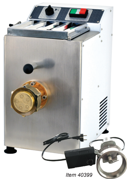
Item 40399 Optional Cutter assembly for PM-IT-0004