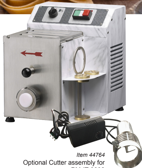
Item 44764 Optional Cutter assembly for PM-IT-0002